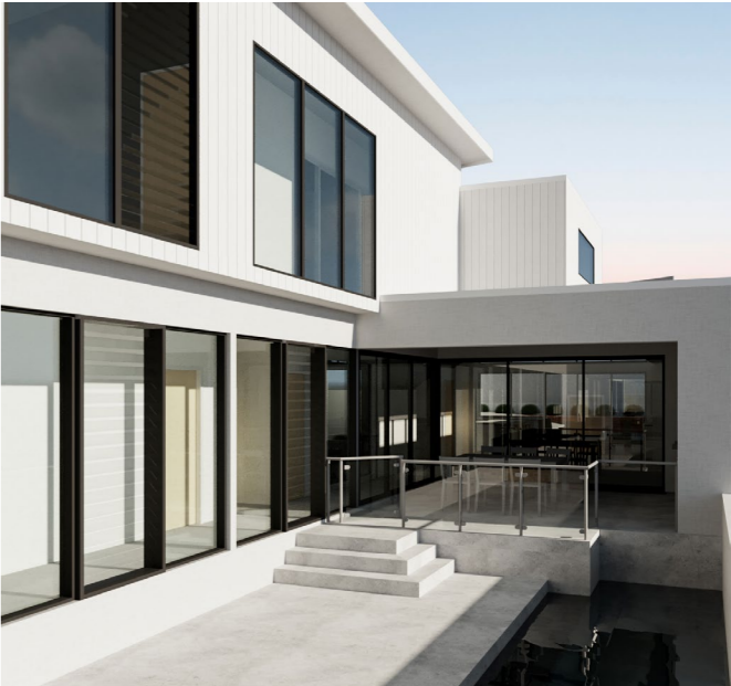
Initial black and white image to give an idea of form followed by a full colour render