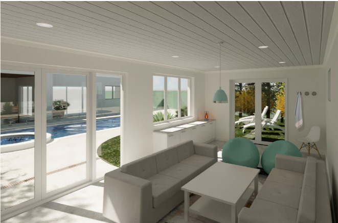
Internally these visualisations are extremely useful to give an idea of space and surface finishes.