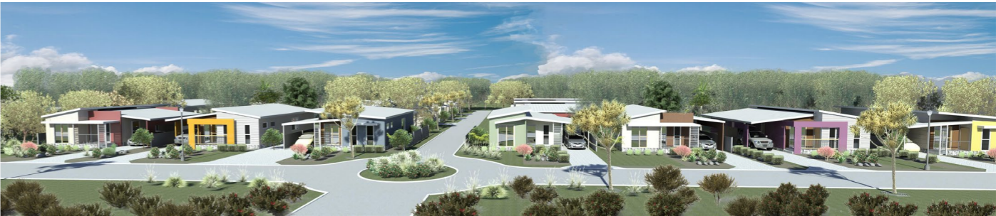
Great for larger scale commercial works to give an overall idea of the finished project.